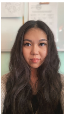
PLACE OF WORK, POSITION